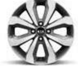
16-inch Alloy Wheel