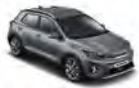
Perennial Gray _ PRG