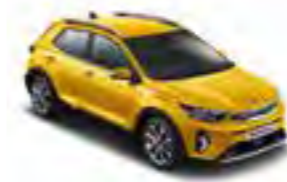
Most Yellow _ MYW