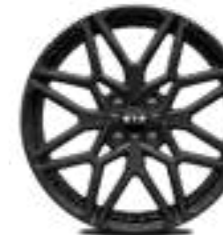
17-inch Alloy Black Wheels