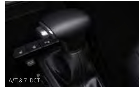
A/T & 7-DCT

When you're just as happy zipping around the city streets as you are exploring what's over the next horizon, the Kia Stonic's choice of two extremely reliable petrol engines offers dynamic performance with lower emissions, making every drive you make a joy and a pleasure.