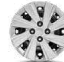
15-inch steel wheel