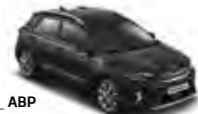
Aurora Black Pearl _ ABP