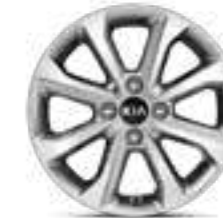
15-inch Alloy Wheel