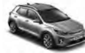
Urban Green _ URG