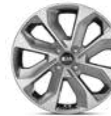
17-inch Alloy Wheel