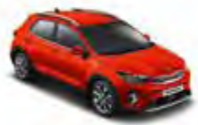
Signal Red _ BEG