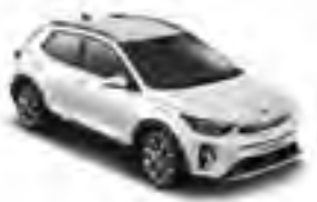
Clear White _ UD