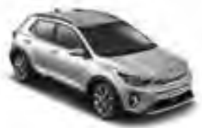
Silky Silver _ 4SS