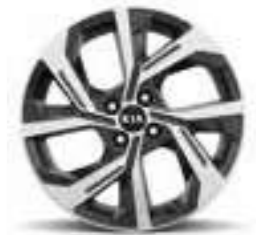
17-inch Alloy Wheels (GT Line only)

Max. 150,000 km vehicle warranty. Valid in all EU member states (plus Norway, Switzerland, Iceland and Gibraltar). Deviations according to the valid guarantee conditions, e.g. for paint and equipment, subject to local terms and conditions. Fuel consumption (l/100 km)/CO 2 (g/km): urban from 4.5 to 6.6, extra-urban from 3.8 to 4.7, combined from 5.2 to 6.1. The specified consumption and emission values were determined according to the legally prescribed measurement procedures (EU) 2017/1153. The above values have been tested in the new WLTP (Worldwide Harmonized Light vehicle Test Procedure) test cycle and converted back to NEDC (New European Driving Cycle). In addition measured according to the RDE (Real Driving Emissions) method. * WLTP