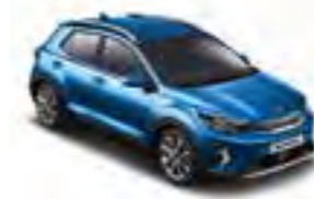
Sporty Blue _ SBP