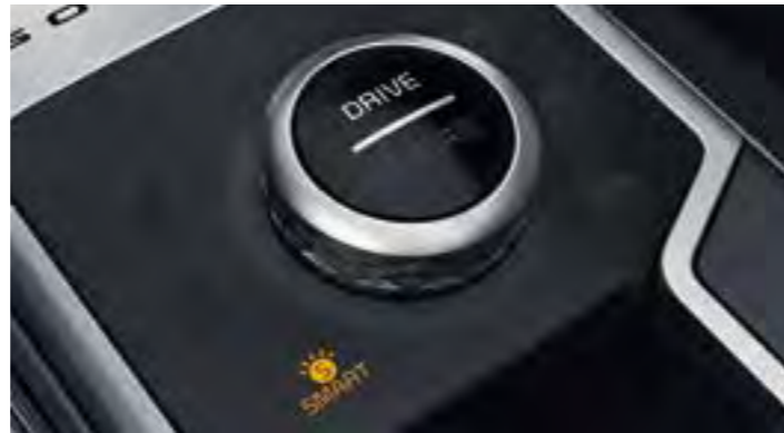
DRIVE MODE SELECT (DMS)

Refined, chrome-finished paddle shifters coordinate with the rest of the cabin's design, and allow you to change gears swiftly without taking your hands off the steering wheel. They also boost driving dynamics, making it effortless to increase torque faster, while staying in control.