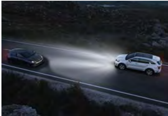
HIGH BEAM ASSIST (HBA)

Whether short or long, it's good to know that on every journey you take, your Kia Sorento is helping to keep you and your passengers safe and secure.