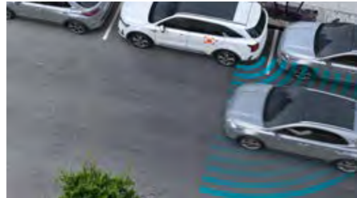
SAFE EXIT ASSIST (SEA)

Designed to improve visibility for blind spots, the BVM uses side cameras so that when you indicate left or right, your instrument cluster will show the view of the road in your blind spot. Indicate left and it will show you the rear view down your left-hand side; indicate right and it will show the right-side view.