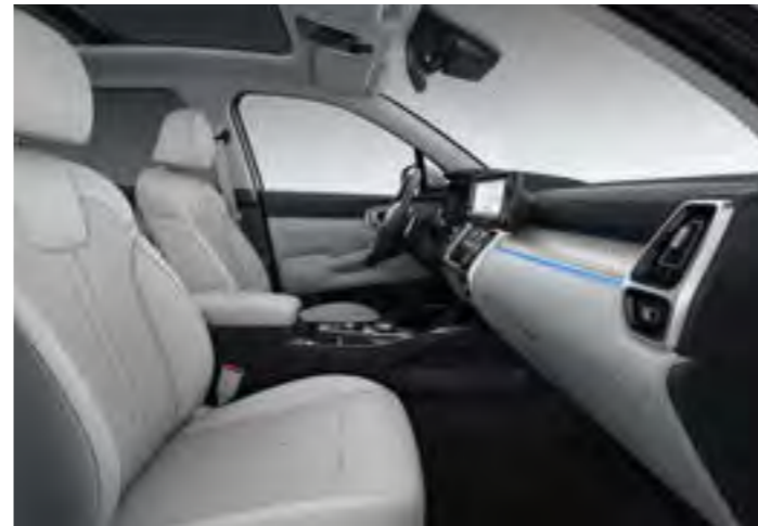
GLS OPTIONAL GREY LEATHER