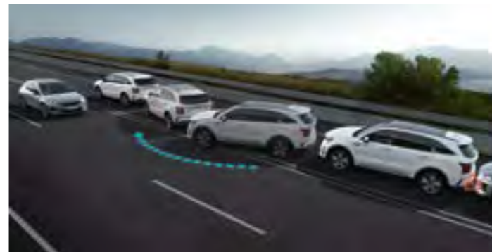
MULTI-COLLISION BRAKE ASSIST (MCBA)

Designed to help prevent rear passengers from exiting the vehicle when the system detects potential hazards approaching. If that happens, the system will engage the power locks, and give an audible and visual alert.