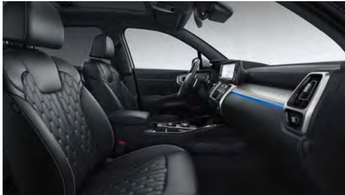
GLS OPTIONAL BLACK QUILTED NAPPA LEATHER WITH GREY STITCHING AND PIPING

For that stylish finishing touch, all leather seats come with brushed TOM film garnish and 3D embossing, while black cloth seats come with a metal-effect paint garnish with 3D embossing. In addition, there is a stunning grey leather seat option and black leather seats featuring a black one-tone detail colour. Black nappa seats are also complemented by a black interior headlining.