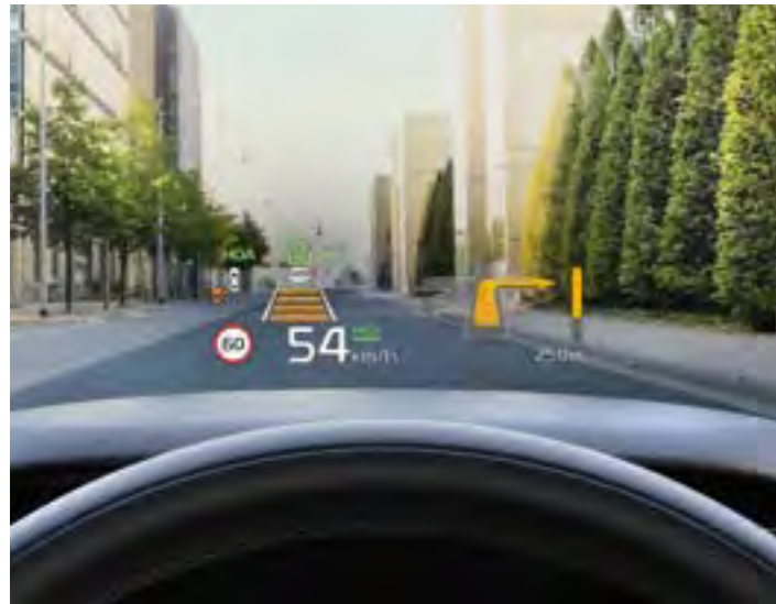
HEAD-UP DISPLAY (HUD)

When you know the way you go, it's also great to know that your loved ones can share the Sorento experience in its ergonomically designed, spacious and comfortable cabin.