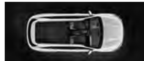
2nd row folded fully flat (5-seater)

Whatever you've got planned and whatever you want to carry, the Sorento comes well prepared.