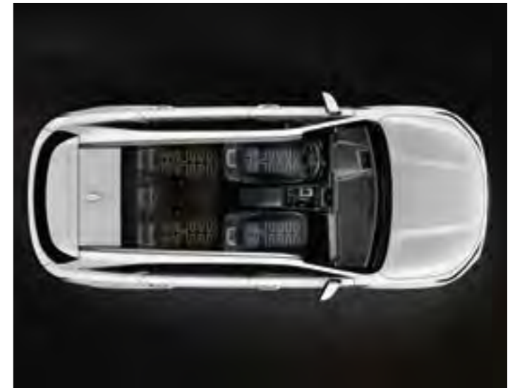
HEATED AND VENTILATED SEATS

Up to two different drivers can set their mirror and seat preferences using the integrated memory system. For added comfort and convenience both the driver and front passenger seats come with lumbar support. What's more, the driver seat has a cushion that is extendable and integrates the far-side airbag, which prevents the driver's and passenger's heads coming into contact in the event of a collision.