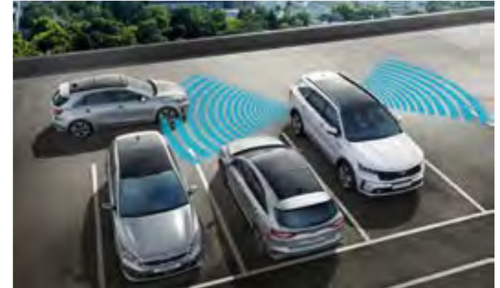
REAR CROSS TRAFFIC COLLISION AVOIDANCE ASSIST (RCCA)

Using its rear-view camera and rear ultrasonic sensors, PCA prevents the vehicle from colliding with pedestrians or nearby obstacles behind you when you park in or exit a parking spot, as well as when travelling at low speeds. If it anticipates a collision with an obstacle, the system warns the driver with visual and audible alerts while engaging the vehicle's brakes to prevent a collision.