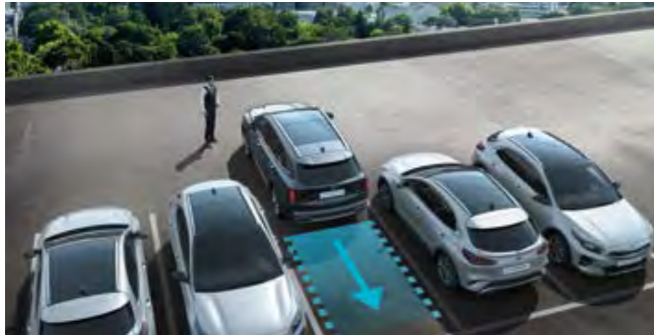
REMOTE SMART PARKING ASSIST* (RSPA-ENTRY)

The new Kia Sorento helps you stay aware of what is happening around you and of other vehicles, enhancing your comfort and safety on both short and longer journeys.