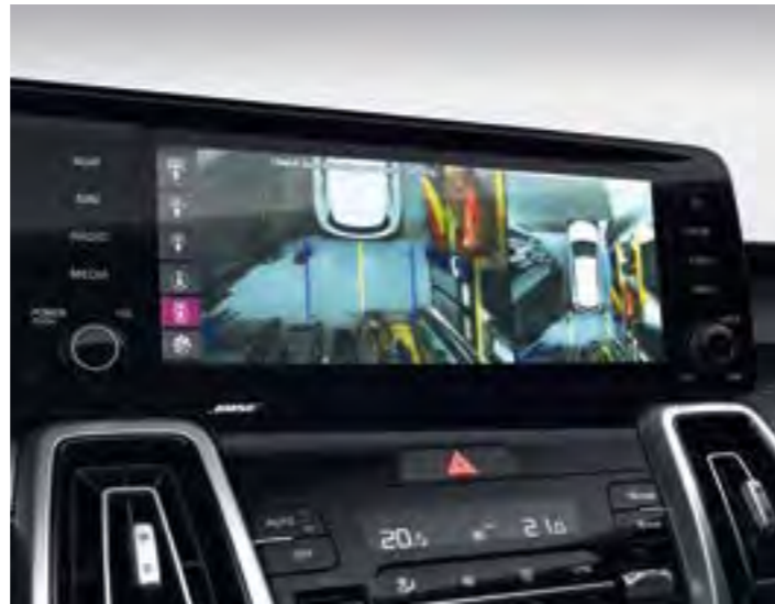
360° SURROUND VIEW MONITOR

Stay safe and sound: to ensure you keep your eyes on the road, the HUD projects graphics and other driving-related information onto the windscreen, directly in your line of sight.