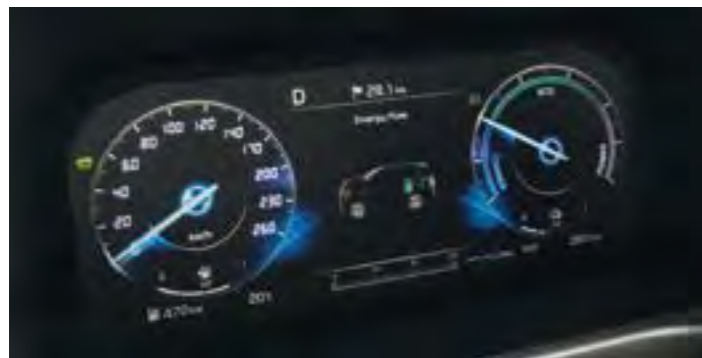
12.3" FULLY DIGITAL TFT INSTRUMENT CLUSTER

The system's regenerative braking takes advantage of every decrease in vehicle speed, capturing energy and storing it in the battery for future use.