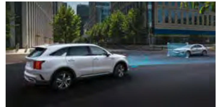
FORWARD COLLISION-AVOIDANCE ASSIST (FCA)

Uses ultrasonic sensors that are designed to detect children or pets in the second or third row, and gives visual and audible alerts if it detects movement inside, before and after the vehicle has been locked.