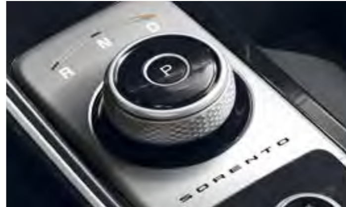
ROTARY GEAR SHIFT DIAL

The new automatic transmission offers a choice of drive modes that allow you to customize the powertrain's responses to driver inputs, enhancing your fuel economy or acceleration. The Sorento combustion diesel model offers four drive modes, Eco, Comfort, Sport and Smart, while the Sorento HEV offers Eco, Sport and Smart modes. The Drive Mode Select system also adapts the weight of the rack-mounted power steering system, for more relaxed or more immediate, engaging steering responses.