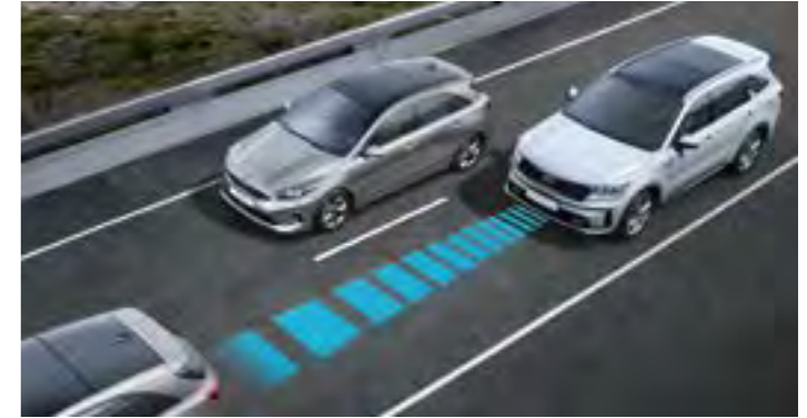
SMART CRUISE CONTROL WITH STOP & GO (SCC W/S&G) AND NSCC

Kia's level 2 autonomous driving system takes a giant leap towards semi-automated driving. In collaboration with Smart Cruise Control, LFA controls acceleration, braking and steering depending on the vehicles in front. This makes driving in traffic jams easier and safer. The system uses camera and radar sensors to maintain a safe distance to the preceding vehicle and monitors road markings to keep your car in the centre of your lane. LFA works between 0 and 180 km/h.