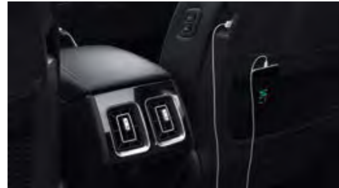
USB PORTS AND POWER FOR ALL

Experience the very best in-car entertainment with 12 speakers, an external amplifier and cutting-edge technology. Transform any stereo or multichannel audio source into an astounding surround sound experience.