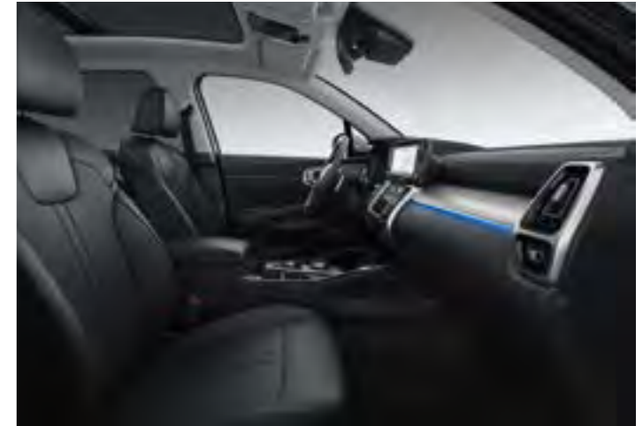
GLS OPTIONAL BLACK LEATHER