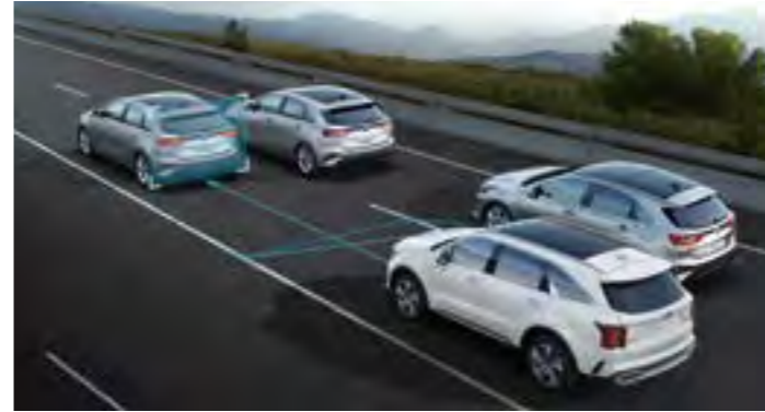
LANE FOLLOWING ASSIST (LFA)

DAW monitors your steering wheel, indicator and acceleration patterns and warns you if you're losing concentration. For example, when in traffic, if the car in front of you drives away and you don't move it will alert you; or if you're showing signs of drowsiness, DAW will encourage you to take a break.