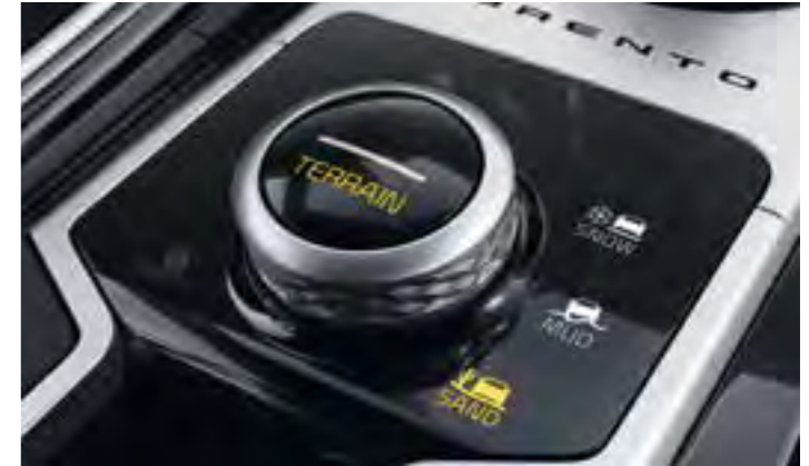
TERRAIN MODE SELECT (TMS)

Both the Sorento 1.6 T-GDi HEV and 1.6 T-GDi PHEV come with six-speed automatic transmission, ensuring a smooth transition between gear changes.