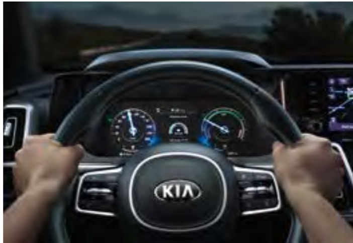
DRIVER ATTENTION WARNING (DAW)

When conditions allow, the Sorento will turn on its high beams automatically. When the camera in the windscreen detects the headlights of an oncoming vehicle at night, the High Beam Assist system automatically switches to low beam to avoid dazzling other drivers.