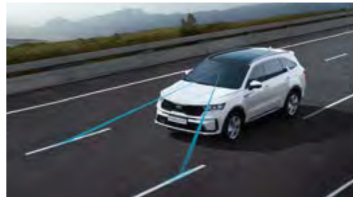
LANE KEEPING ASSIST (LKA)

Using camera and radar, SCC maintains your set speed, ensuring a safe distance between you and the vehicle ahead. It also controls acceleration and deceleration to ensure your vehicle stops when the vehicle ahead does and then moves off when the other vehicle moves again. What's more, SCC is navigation-assisted and uses ADAS map information, allowing it to auto-decelerate your speed on any bends for added safety and to keep within the speed limit.