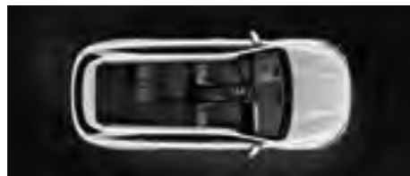
2nd row partially folded (5-seater)