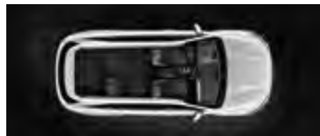
3rd row folded fully flat and 2nd row partially folded