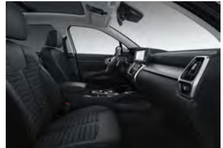
GL AND GLS STANDARD BLACK CLOTH (not available with panoramic sunroof)