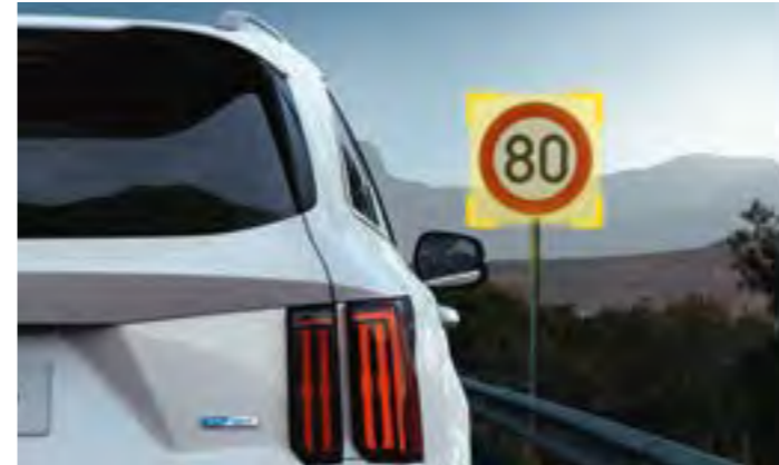
INTELLIGENT SPEED LIMIT ASSIST (ISLA)

Remote Smart Parking Assist (RSPA) is a convenient parking system that makes it easier when parking your vehicle or exiting from a parking spot by automatically parking or manoeuvring the vehicle. It is also possible to remotely move your vehicle forwards and backwards while standing outside, using a key fob.