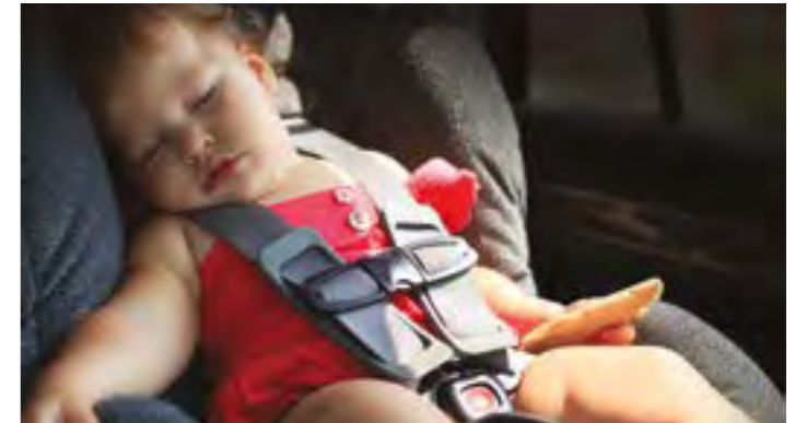
REAR OCCUPANT ALERT (ROA)

If your airbag is fired in response to a primary collision, a signal is immediately sent to the Electronic Stability Control system to brake your vehicle. MCBA applies your brakes to prevent a subsequent collision or mitigate its impact.