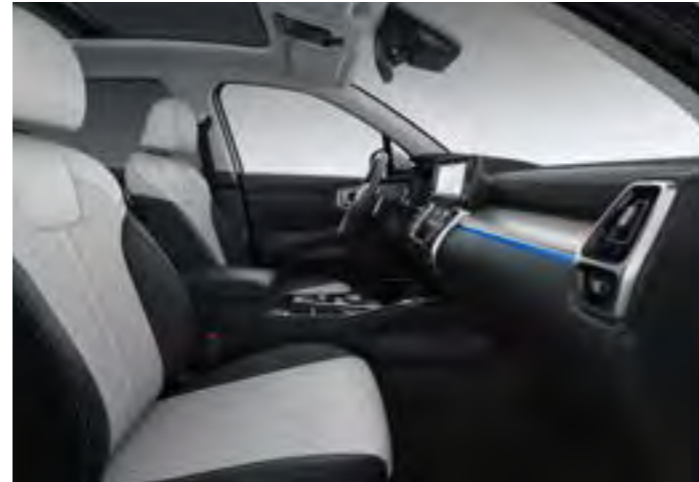
GLS OPTIONAL 2-TONE GREY/BLACK LEATHER