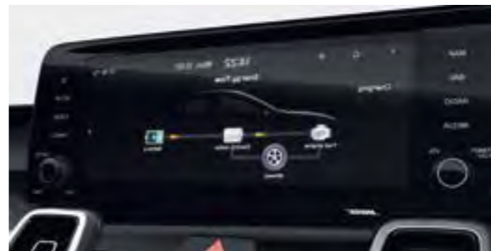
10.25" NAVIGATION DISPLAY

An intelligently designed, customizable supervision cluster provides temperature information, tyre pressure alerts and other essential vehicle and trip information. It also displays the status of the hybrid charging system, including fuel and battery levels and use. Its high-resolution screen makes it easy to read a wealth of information at a glance.