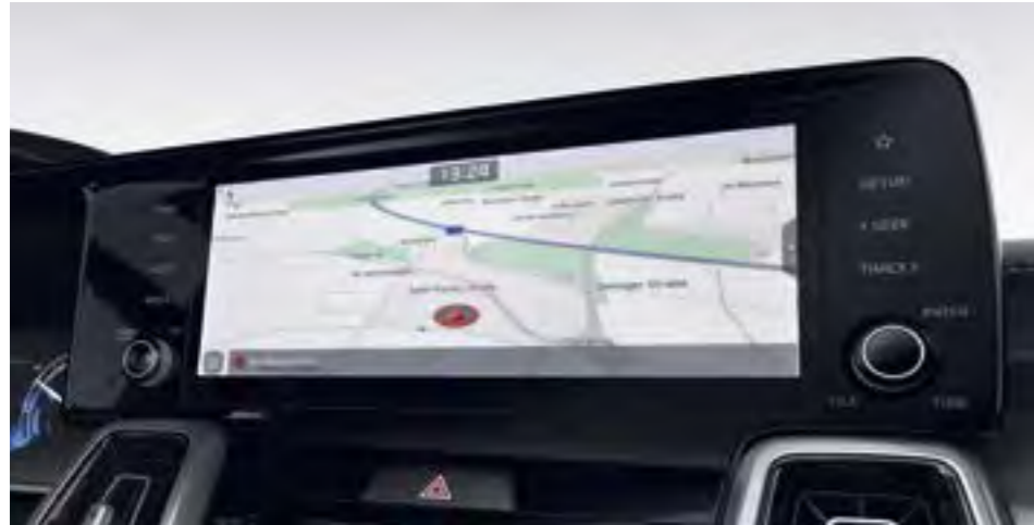
10.25" NAVIGATION SYSTEM

From the moment you sit inside the new Kia Sorento you'll discover an array of the latest information and entertainment technology, designed to put you in complete control for whatever adventures lie ahead.