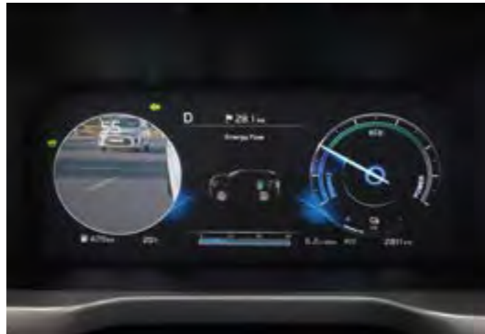
BLIND-SPOT VIEW MONITOR (BVM)

When you want to change lane, the Blind-Spot Collision-Avoidance Assist system detects any vehicle(s) in your blind spot and alerts you with a warning symbol in your side mirror and on the head-up display inside the car. Should you start to change lane while a car is in your blind spot, the Sorento will automatically apply the brakes to avoid a collision, the side mirror and head-up warning symbols will flash and an audible alert will sound.