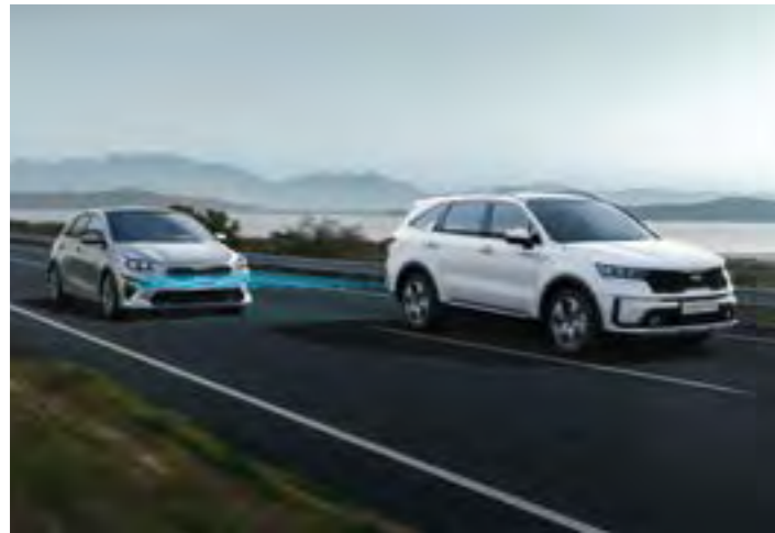
BLIND-SPOT COLLISION-AVOIDANCE ASSIST (BCA)

No one knows what the road or journey ahead can throw at us and that's why the new Sorento comes with highly refined solutions for a safer journey.